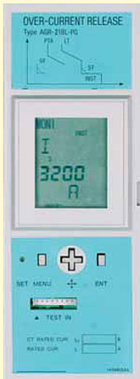
Standard OCR with LCD- 'Ammeter' Type AGR-21B,22B.