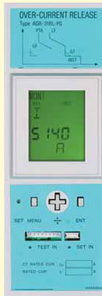
Enhanced OCR with LCD- 'Analyzer' Type AGR-31B.